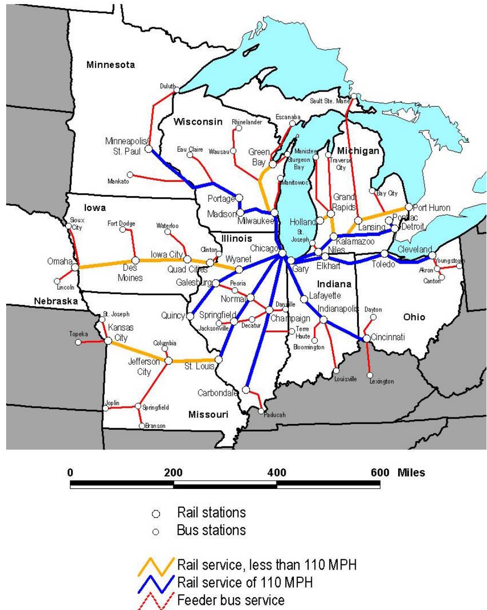
Map of the nine states included in the Midwest Regional Rail Initiative.

Illinois has begun track rehabilitation work in the Chicago–St. Louis corridor between Joliet and Springfield. The rehabilitation work being performed by Union Pacific crews will bring the track up to Class 6 standards, allowing speeds of up to 110 mph. Illinois has also continued to sponsor the $60 million North American Joint Positive Train Control Project, along with the Association of American Railroads and the Federal Railroad Administration (FRA). This project is focused on developing and demonstrating a nationally applicable positive train control system for speeds of up to 110 mph in the Chicago–St. Louis corridor.