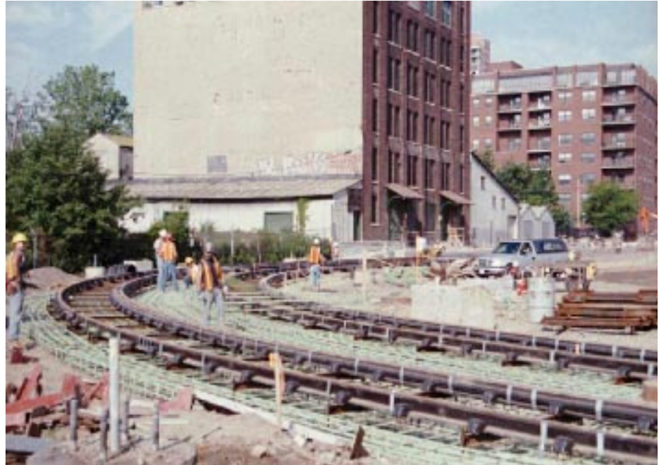
Track being laid for new curve between Hudson Street (right) and Essex Street (background) in Jersey City.

Light rail vehicles for HBLRTS have three sections and are 26 700 mm long by 2680 mm wide. Total unladen weight is about 44 metric tons. The low-floor level in the middle of the car is 350 mm above the rail for about 70 percent of the total length, and the high floor level is 890 mm over the powered trucks at the ends. All passenger doors are in the low-floor area. Platforms at stops are accurately aligned vertically and horizontally with respect to the rail, so the gap does not exceed standards of the Americans with Disabilities Act. Embedded track is used at all stops to avoid future movement of the track structure and changes in the gap dimensions.