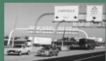
Cover: In Houston, Texas (top), and San Diego, California, value pricing is being tested as a means of reducing traffic congestion in urban and suburban areas. See article beginning page 3.