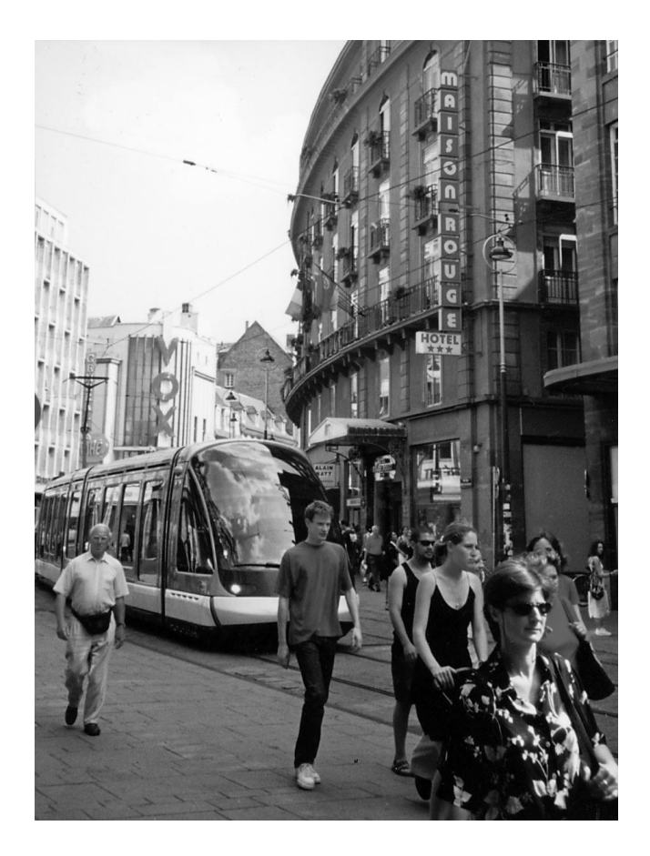
Figure 9. Strasbourg's city center is reserved for pedestrians and trams.

planners determined could be met only by augmenting the bus system with a new LRT system (buses could only divert about 3 percent of automobile users). Similar to many U.S. towns and cities, Saarbruecken's original meter gauge tram system had been dismantled in the mid-1960s.