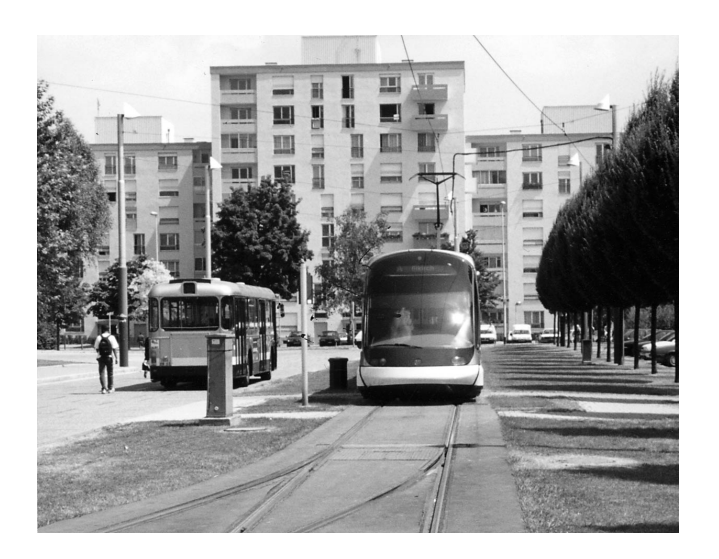
Figure 11. Strasbourg trams and tracks provide a highly visible "homing device" for sightseers and tourists confused by complex bus routings.

Do these new rail transit systems using shared track inspire people to leave their automobiles at home? Transit officials in Cologne estimate that 14 percent of new tram