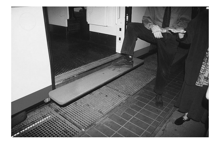
Figure 4. Karlsruhe LRV with two-height retractable steps deployed at higher level for high platforms.

German streetcar traction voltages run between 600 v DC and 760 v DC. Railroad traction currents in Germany are standard at 15 kv AC. Other western European railroad voltages most commonly are 750 v DC, 1500v dc, 25kv AC. This presents a challenge to sharing track, but it is a dilemma that has already been addressed and resolved with dual- and