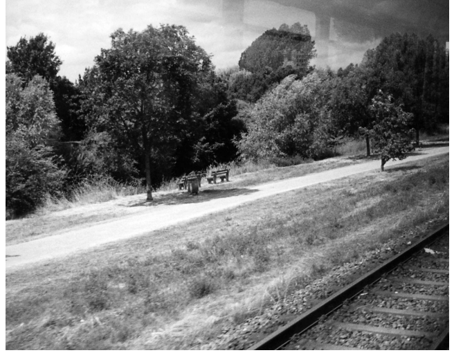
Figures 12 and 13. A wide variety of bicycle and pedestrian pathways run adjacent to urban and rural rail lines (Cologne and Karsruhe).