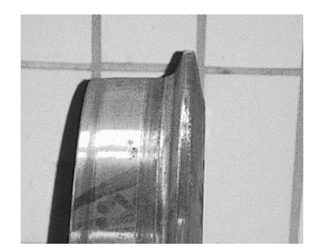
Figures 1 and 2. Karlsruhe special wheel profile with flange modified to be compatible with street rail and railway operation. Picture of wheel at bottom is from Karlsruhe maintenance shop.

radius streetcar curve. Those DMU models equipped with electric transmissions have more flexibility, yet only a few models can negotiate down to a 130-ft radius. This was a major consideration in NJ Transit selecting a DMU model for its Trenton Camden diesel light rail service.