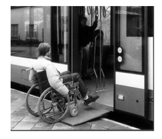
Figure 5. Picture from Duren brochure shows use of deployable wheelchair ramp.