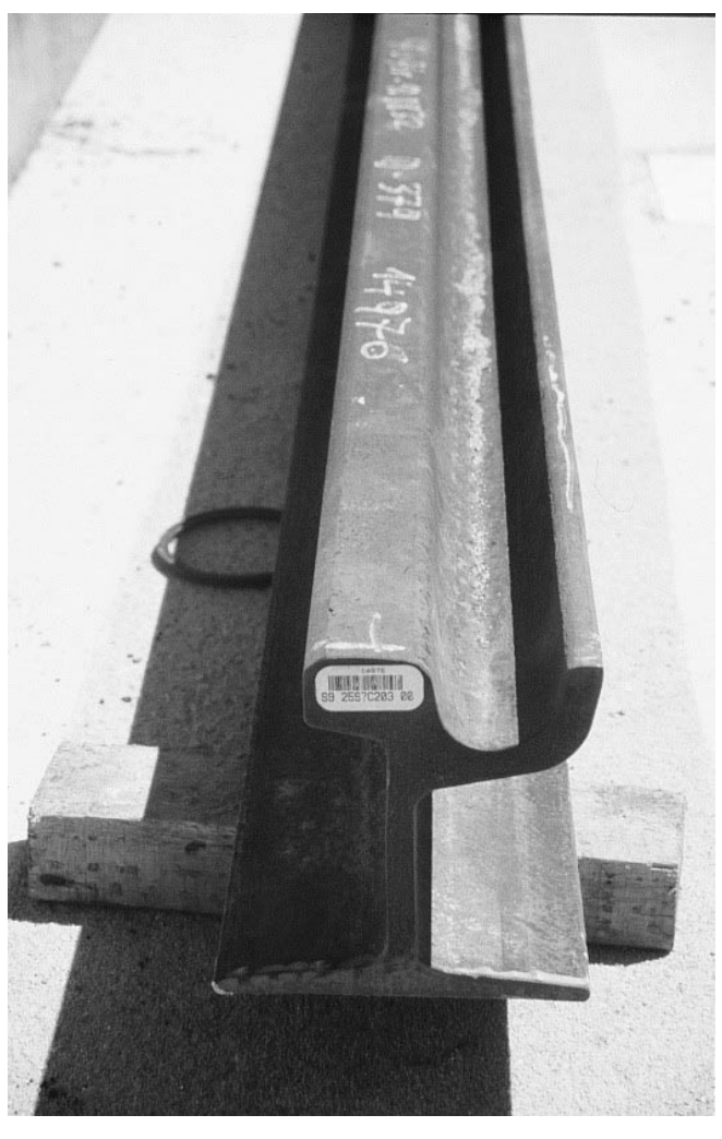
Figure 3. End view of new rail being installed at Saarbahn line extension in Saarbrucken. Note deep flangeway, which accommodates standard railroad wheel flange.