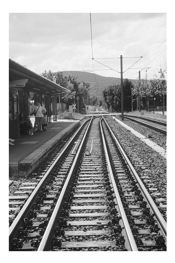
Figure 7. "Gauntlet track" system at a station on Baunatal shared-use railway line in Kassel. Automated equipment with entered codes aboard the LRV signals the switches to select the tracks nearest the platform.

triple-voltage railroad rolling stock crossing international borders. EU will promote continuance of multiple voltage equipment, and it is, therefore, technically realistic to apply it to equipment that shares tracks and overhead catenary traction currents. This is a nonissue in North America, where electric traction on railroads is a rarity. The DMU or dual power (electric and internal combustion) becomes the equivalent way of powering a rail car that must operate under streetcar wire and independently with on-board generated power when on railroad track.