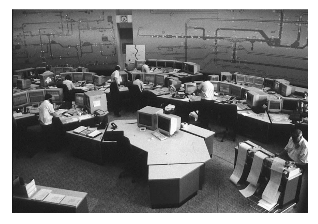
Figure 15. Cologne Control Center unifies right-of-way dispatch, voice communications with LRV's and buses, and security functions.